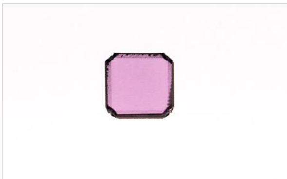
The diamond sample has a high NV concentration after irradiation, which is responsible for the pink color.